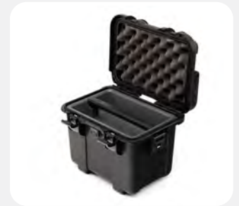
Tray & Rigid Divider