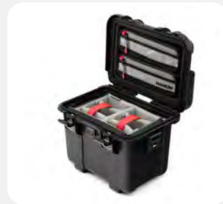
Pro Photo Kit