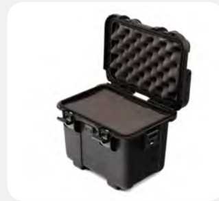
Cubed Foam & Eggshell