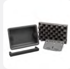
Tray & Rigid Divider