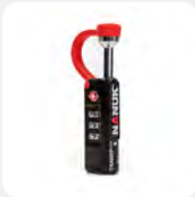
Nanuk TSA Padlock