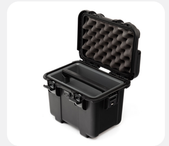
Tray & Rigid Divider