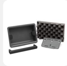
Tray & Rigid Divider