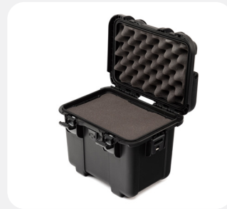
Cubed Foam & Eggshell