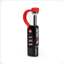
Nanuk TSA Padlock