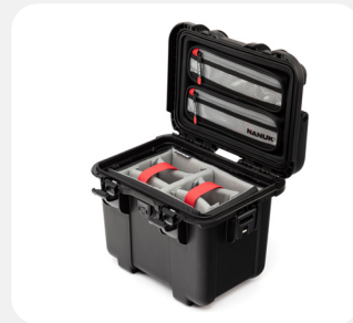
Pro Photo Kit